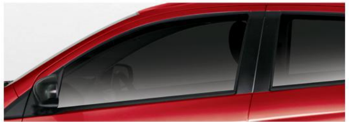
NEW Black Painted Door Mirror and NEW B-Pillar Black Sash