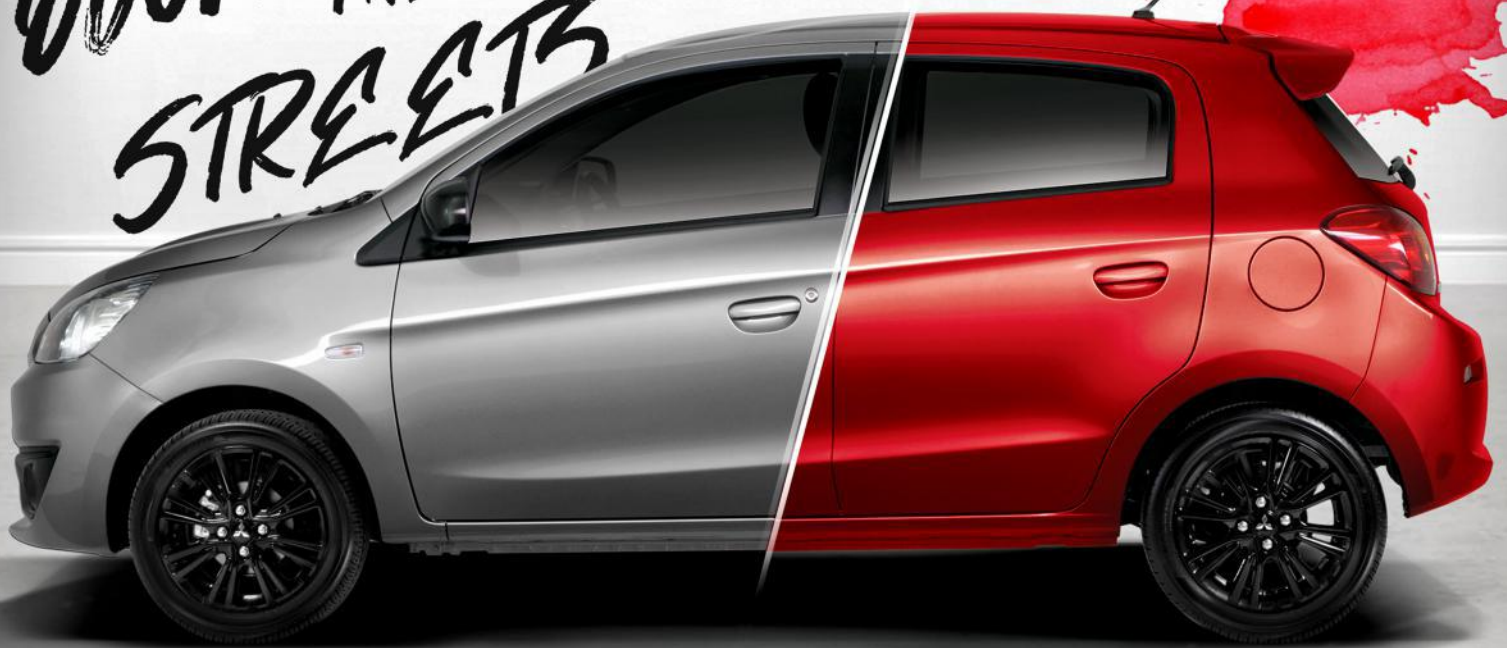
Titanium Gray Metallic