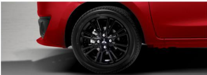
NEW 15" All Black Alloy Wheels